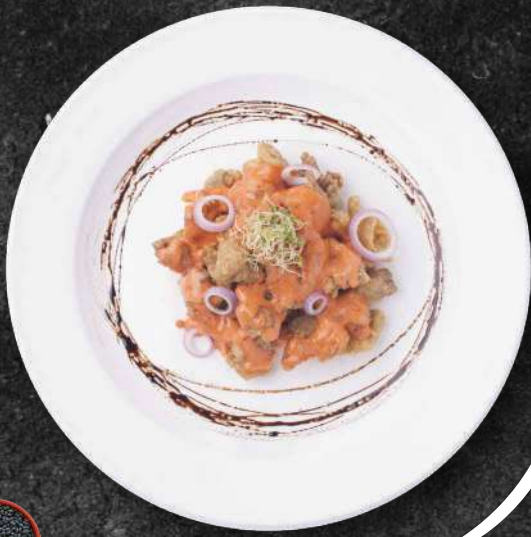
NS70 蒙古鸡丁 Wok-fried Chicken Cubes with Mongolian Sauce