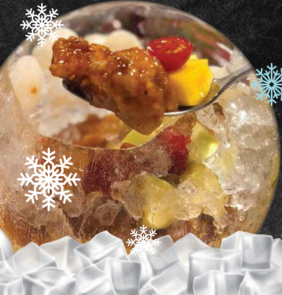
雪山寻宝 Icy Treasure